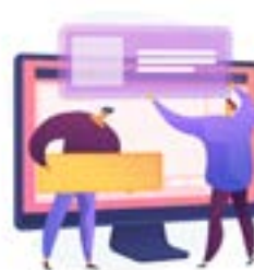
Landing page creation